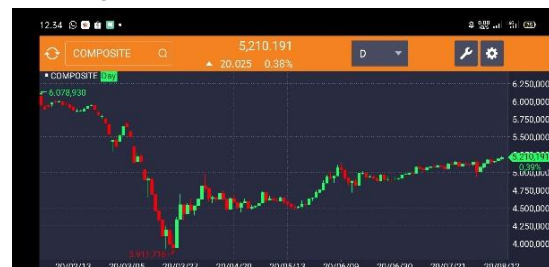
Figure 1. Composite Index Chart

This research found facts that were rare discussed in the previous research by any one. Mostly those concerned on individual stocks rather than sectoral indexes. The sectoral risk mitigation will give direction to the investors to guide the safe sector before selecting individual stock or portfolio as in the normal condition. In the normal condition investors mostly concern on technical and fundamental factors.